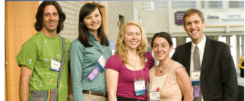
One of the world's largest privately sponsored international scholarship programs focuses on humanitarian service, personal diplomacy, and academic excellence.

More than 400 university students from 40 countries have been selected to study abroad as Rotary Ambassadorial Scholars during the 2011-12 academic year.