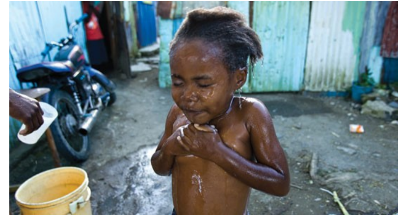
A child bathes in the streets of La Grúa, Dominican Republic. Rotarians are educating people in the community about the effects of contaminated water.

More than two million people die each year because they lack access to safe drinking water and proper sanitation. To draw attention to the need for action, Rotarians joined the world on 22 March to observe World Water Day. Established by the United Nations in 1992, World Water Day highlights the increasing demands being placed on the world's freshwater supplies. This year's theme "Clean Water for a Healthy World" focuses on the importance of water quality.